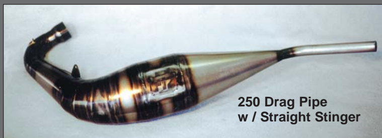
250 Drag Pipe w / Straight Stinger

This is our tried & true Blaster design. Uses standard Blaster silencers.....$280